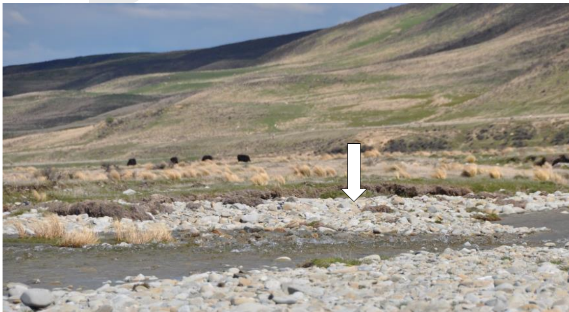
Plate 1: Black-fronted tern colony site, 2014. Arrow indicates location of colony (4-5 nests).

Black-fronted terns are also a relatively mobile species that require only small areas of clear gravel to establish colonies (see Plate 1). Colony sites can change between years, and surveys on the Manuherikia have shown that tern colonies can establish throughout the river. Like black-billed gull, the availability of breeding habitat is unlikely to be a limiting factor on the Manuherikia, and therefore the species is likely to nest elsewhere on the river once the lower section has been inundated.